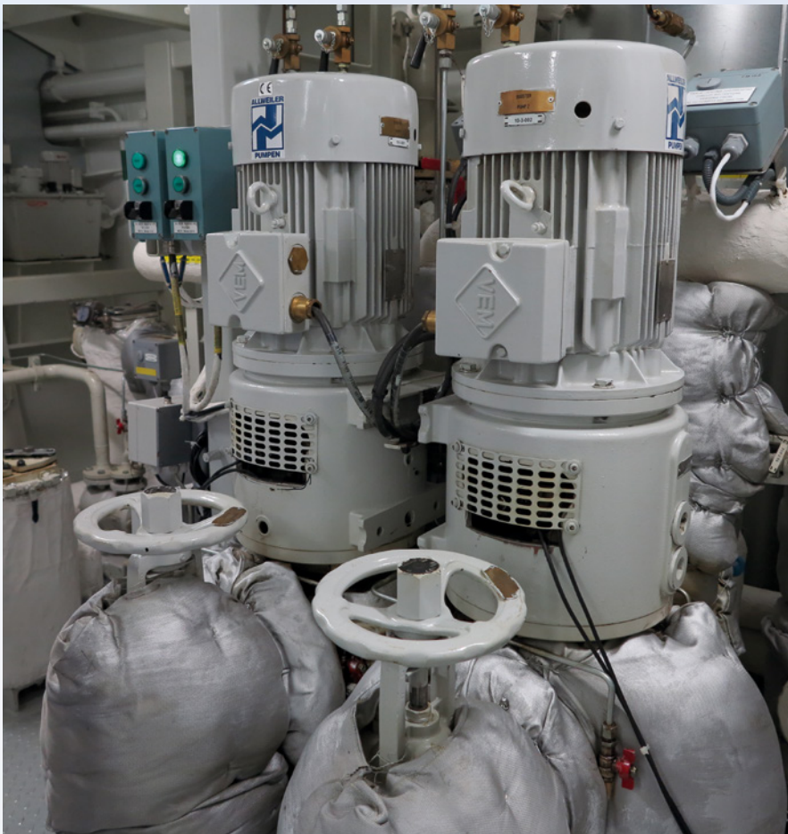
Vertical screw pumps are used as booster pumps for different grades of fuel.