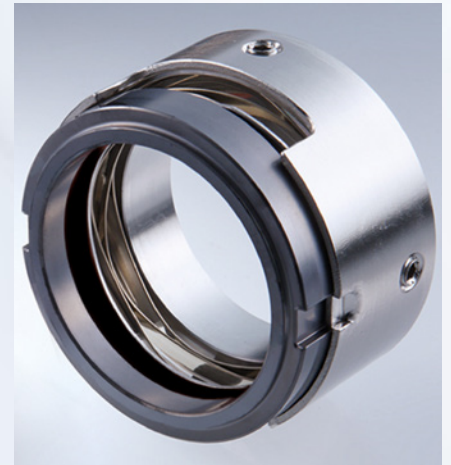
Rotating unit of EagleBurgmann type M7 mechanical seal. This universal shaft seal has proven its worth millions of times over.

ECAs (Emission-Controlled Areas) were established a few years ago in the North Sea and Baltic shipping areas, the English Channel and the US and Canadian coastal regions. Ships that operate in these waters must reduce their sulfur emissions to 0.1% m/m. While heavy fuel oil (HFO) is used as a fuel outside these ECAs, ships switch to light fuel oil (MDO - Marine Diesel Oil) with its lower sulfur content within the environmental zones and in harbors.